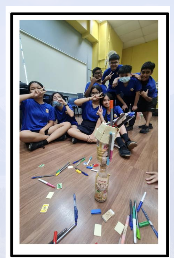
Sports & Games