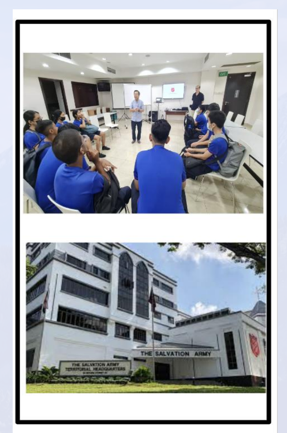
Learning Journey to Salvation Army