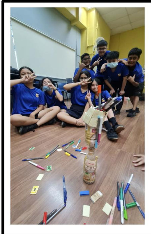
Sports & Games