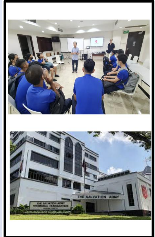
Learning Journey to Salvation Army